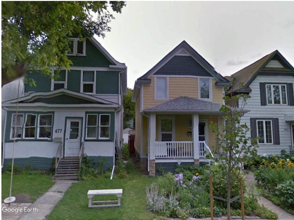
A typical Wolseley street

And before you ask – yes, of course, being close to downtown we have our share of property theft, addiction problems and homeless camps, but we also have a community that overwhelming advocates for a humane and compassionate approach to those problems.